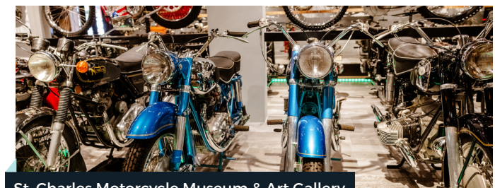
St. Charles Motorcycle Museum & Art Gallery