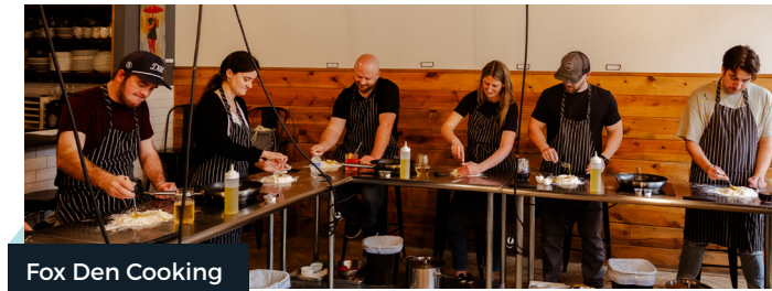
Fox Den Cooking